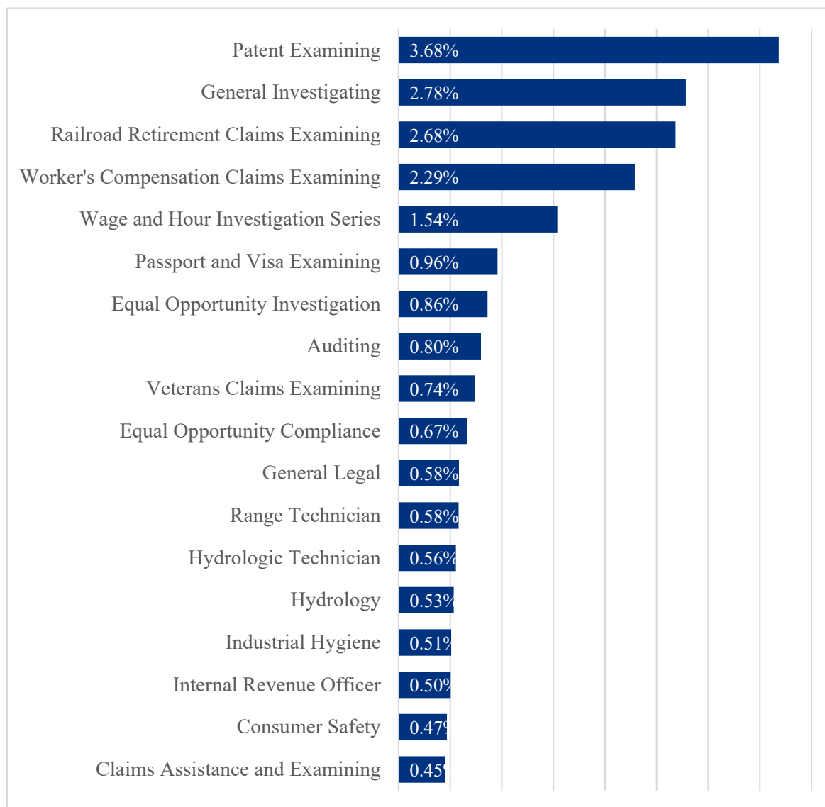
Chart 2: Occupations with the Highest Rates of WGI Denials

While case work can influence WGI denial rates, it does not stand alone. As noted in the prior section, the rating pattern used by an agency matters, too. One agency (“Agency W”) demonstrates how these two things can interact. This agency has a workforce primarily engaged in case work—which typically results in higher WGI denial rates. But its rating pattern has no Level 2—and the absence of a Level 2 is associated with lower WGI denial rates.